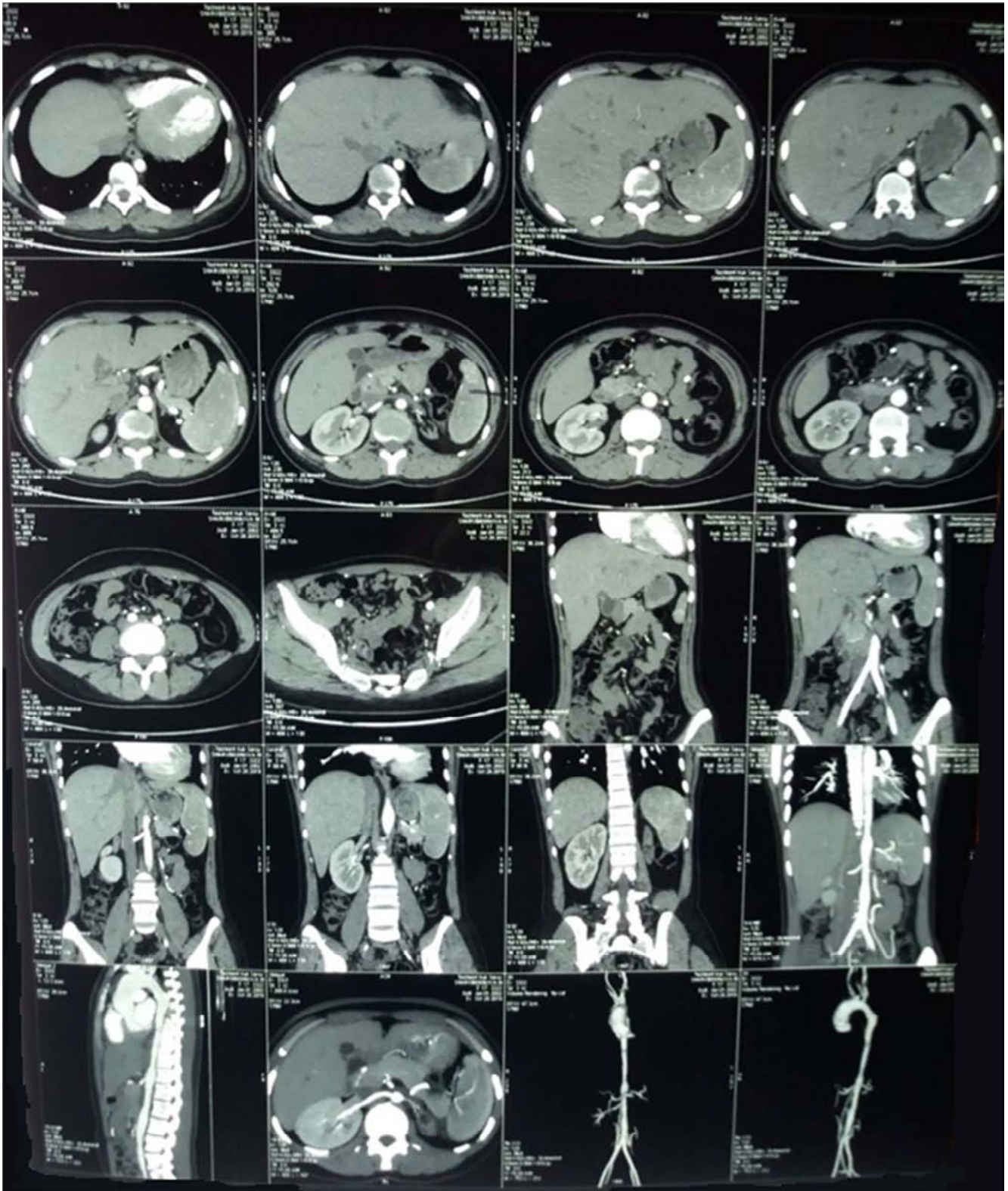
Figure 2. Multi-slice CT of thoracic and abdominal aorta.